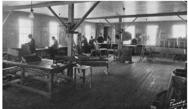
Farm Shop (1936)

----- How many of us remember the farm shop classes we attended in this building?