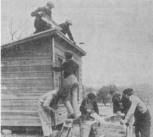
Construction Class (1919)

Once an important part of the Essex Aggie field of study, any trace of the Poultry Department can no longer be found on the Aggie campus.