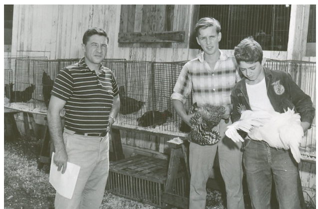
Poultry Judging Class (1950s)