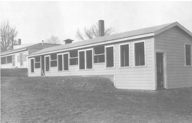
New Brooder House (1930)