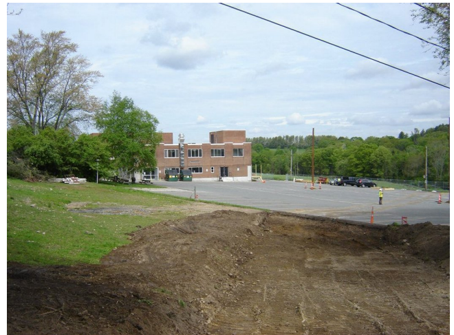
This is the new entrance to the new school now under construction. The Berry Hall parking lot and Berry Hall itself will soon be torn down.