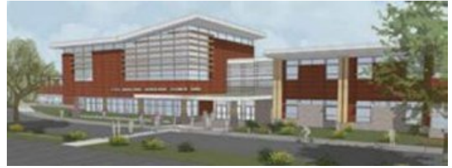
The New Essex North Shore Agricultural Technical School

The construction of the 1,440 student new school is expected to cost $133.7 million and it will take two years to complete. Work will be completed in September of 2014.