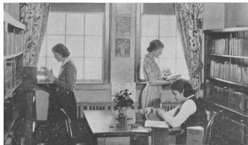
Homemaking School Library 1937