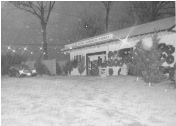
The Farm Stand today