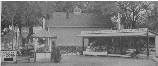
Roadside Stand (1937)