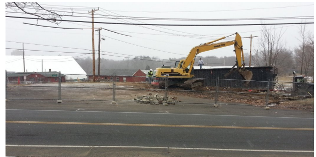
Farm Stand Demolition (2014)

In recent years the Farm Stand had seen little use and was used mostly for student plant sales. (Note: the sign over the door has changed from Essex Chapter Future Farmers of America to Essex Agricultural and Technical High School)