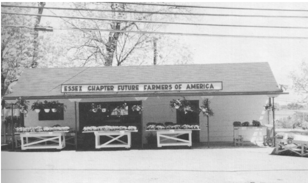
Farm Stand (1988)

From the 1950s to the 1990s the Farm Stand was heavily used and was a popular place on the Aggie campus.