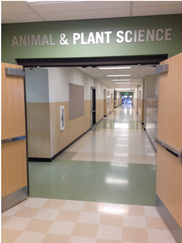
Animal & Plant Science Hallway