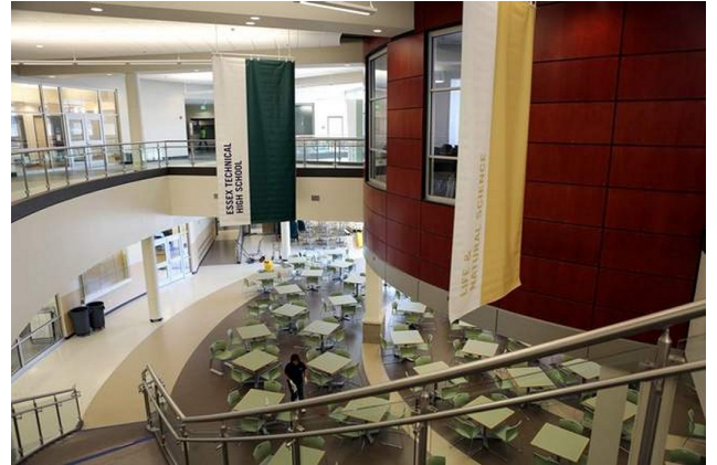
Main Dining Hall