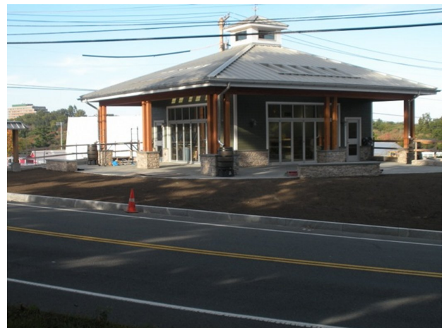
Farm Stand Under Construction (2014)

The end of an era was reached in 2014 when the old Farm Stand was demolished. The countless numbers of students who worked at the stand will always remember the experiences they had working there.