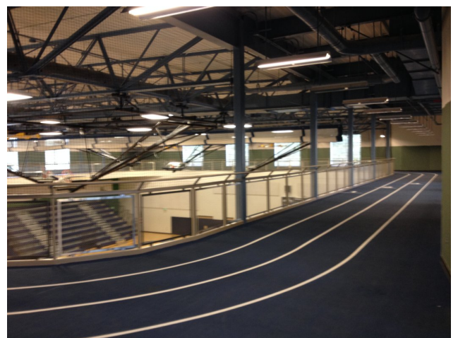
Gymnasium Running Track