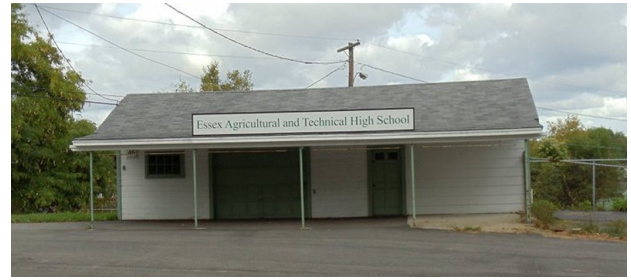
Farm Stand (2011)

From the 1950s to the 1990s the Farm Stand was heavily used and was a popular place on the Aggie campus.