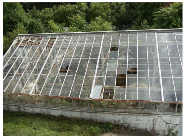
Weeds & broken glass foretell the future.