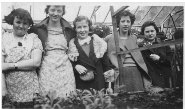
Greenhouse Students (1934)

The Greenhouse area, later known as the Horticulture Greenhouse, remained as an important part of the Aggie for about 80 more years. As the Horticulture courses gravitated to locations across the highway to the other side of the campus the old building was no longer used.