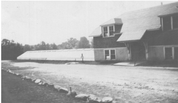
Original Greenhouse Plant (1932)

The new Essex Technical High School will continue to offer courses in Greenhouse Management and Floriculture, but most of the learning will take place across the highway within the new facility. We thought this might be a good time to have a quick look at the old Greenhouse Plant operation which is no longer in use and will soon be demolished.