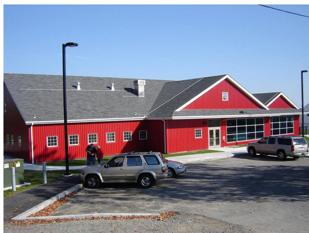
The new Vet Tech Building