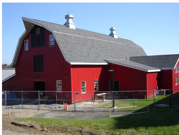
The new Horse Barn