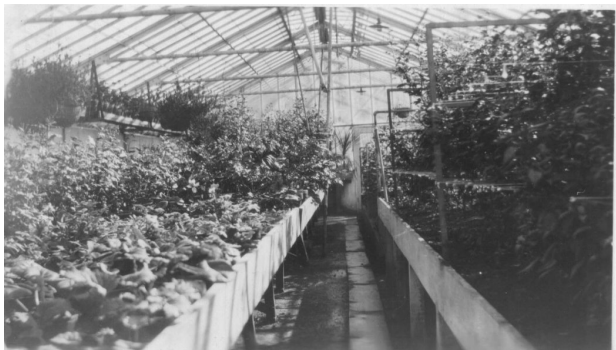
Inside the old Greenhouse Plant (1933)