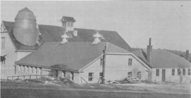
New Cow Barn (1930)