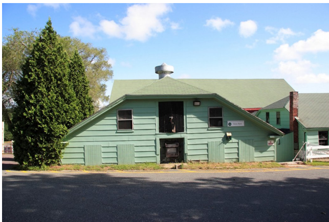
Modern Cow Barn (2012)

For many years the dairy barns were a large part of the Aggie and provided an excellent means of demonstrating the Aggie's theme of "Learn by doing".