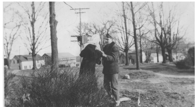
In the background, there it was, the two main buildings of the poultry plant!